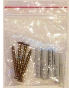
4 x SCREWS AND WALL PLUGS FOR WALL MOUNTING