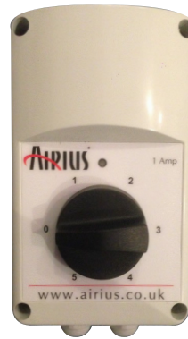
SPEED CONTROLLER (FULLY ASSEMBLED)